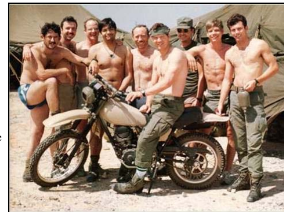
Nine combat control team members at Wadi Kena, Egypt, before leaving for Oman and Desert One on the 1980 Iranian rescue mission.

In 1987, the military activated the unified command as United States Special Operations Command (USSOCOM) at MacDill Air Force Base, Fla. Shortly after the activation, the Army and Navy established service components as major command equivalents and activated Army Special Operations Command (ARSOC) and Naval Special Warfare Command (NAVSPECWARCOM). Although the Air Force relocated 23 AF to Hurlburt Field, Fla., it did not create a separate major command for its special operations forces. In a conciliatory move two years later in 1989, the Air Force eventually divested 23 AF of its non-special operations units. However, later that year the issue quickly became contentious between Gen James J. Lindsay, the commander of USSOCOM, and the commander of Military Airlift Command (MAC), Gen Hansford T. Johnson. The issue was amplified when Gen