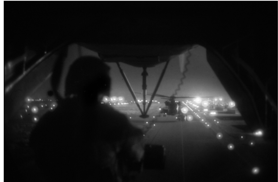
In September 2008, AFSOC flew the final mission of the MH-53M Pave Low helicopter in support of Operation IRAQI FREEDOM.

In September 2008, AFSOC retired the venerable Sikorsky MH-53M Pave Low IV helicopter after four decades of dependable service. Despite its outstanding flight safety record and unparalleled capabilities, the cost of maintaining and flying the aging fleet exceeded the potential benefits of keeping it aloft. On the night and early morning hours of 27 and 28 September 2008, AFSOC's remaining six MH-53s flew their final combat mission. The successful SOF logistical resupply and passenger movement took the Pave Lows on a final run through central and southern Iraq.