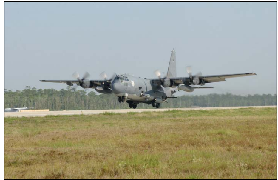
AC-130U “Spooky” Gunship, from the 4th Special Operations Squadron (4 SOS), takes off at Hurlburt Field, Fla.