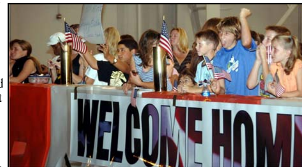
In 2006, family and friends began welcoming home members of the Combined Joint Special Operations Air Component at Hurlburt Field, Florida.

So successful was SOF in OEF and OIF, that in 2004 President George W. Bush expanded United States Special Operations Command's responsibilities under the Unified Command Plan, "as the lead combatant commander for planning, synchronizing, and as directed, executing global operations against terrorist networks." Not only did the president and Congress make lasting impressions, so did the Office of the Secretary of Defense.