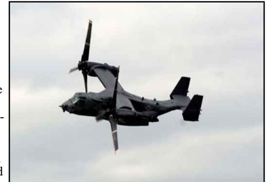
The CV-22 Osprey makes its final descent in November 2006 as the tilt-rotor aircraft arrives at Hurlburt Field, Fla.

In November 2006, AFSOC welcomed its first aircraft specifically built for Air Force Special Operations Forces—the CV-22 Osprey. After only two years of testing and training, AFSOC conducted the first operational deployment of four CV-22s in October and November 2008 to Mali, Africa. Ironically, the first ever operation of Air Force Special Operations Forces in October 1961, code named Sandy Beach One, involved training Malian paratroopers. The 2008 deployment was the first transatlantic movement of the CV-22, the first CV-22 deployment east of the prime meridian, the first CV-22 deployment to Africa, the longest CV-22 flight on record at 8.7 hours and 5,230 miles, and the first flight with strategic air refueling supporting tilt-rotor refueling by KC-135s and MC-130s tankers.