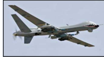
The MQ-9 Reaper provides ISR to the special operators in the field.

Tracking down elusive enemies was harder than akin to finding ‘a needle in a haystack.’ In fact, it was like trying to find a needle among other needles. But in October 2005, AFSOC began the MQ-1 Predator unmanned aircraft mission with the activation of the 3d Special Operations Squadron (3 SOS). AFSOC began its