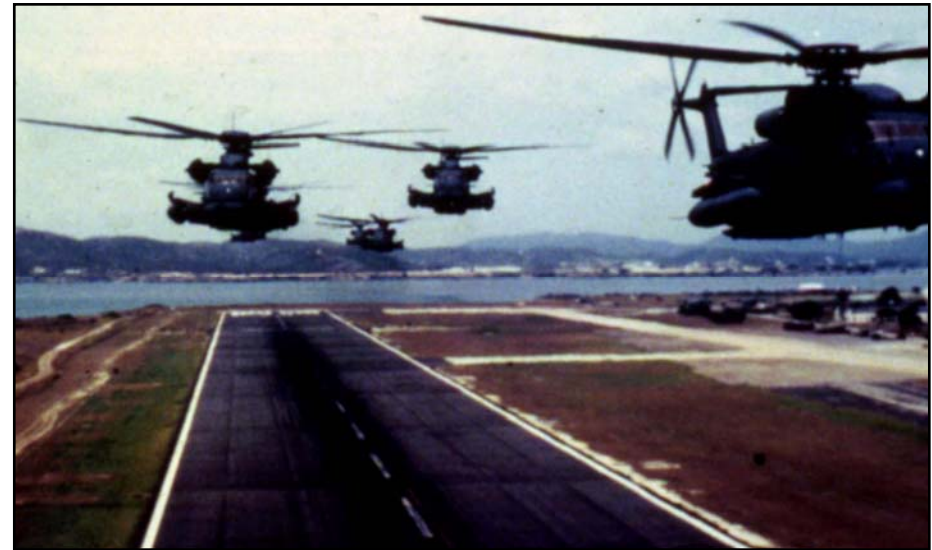
MH-53J Pave Low helicopters enter Port-au-Prince, Haiti, in support of Operation UPHOLD DEMOCRACY.