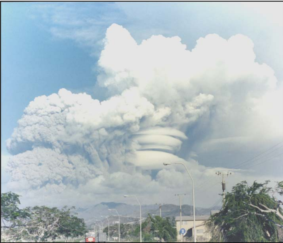
Mount Pinatubo volcano near Clark Air Base, Republic of the Philippines, erupting in June 1991.

In January 1992, the 39 SOW relocated from Rhein-Main Air Base, Germany, to RAF Alconbury, United Kingdom, and eventually inactivated and its personnel and equipment reconstituted to the 352 SOW. In December 1992, AFSOC redesignated the 352 SOW and 353 SOW as independent special operations groups (SOG). Further reorganization occurred on Hurlburt Field that included: in March 1992, the 1720 STG was redesignated the 720 STG; ownership of Hurlburt Field transferred from Air Mobility Command (AMC) to AFSOC in October 1992; and the 834th Air Base Wing merged into the 1 SOW and assumed host unit responsibilities—a year later the 1 SOW inactivated and the 16 SOW activated in its place. Meanwhile, in April 1994, the Special Missions Operational Test and Evaluation Center was redesignated the 18th Flight Test Squadron (18 FTS).