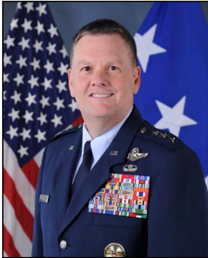
Current AFSOC Commander