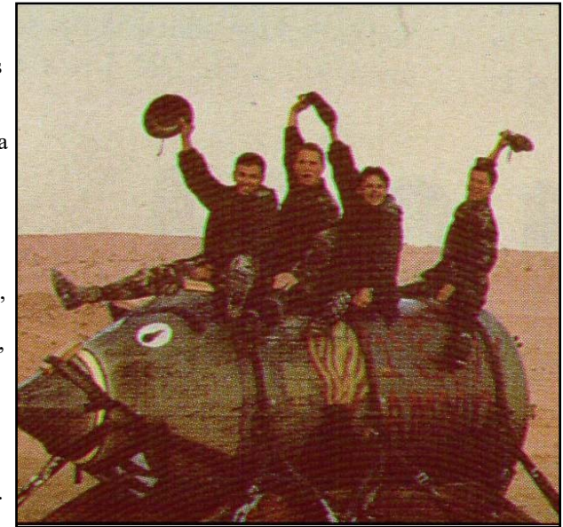
AFSOC dropped 11 BLU-82 Daisy Cutter bombs—15,000 pounds of massive destructive power that obliterated targets.

Following the Gulf War, AFSOC continued to stand alert for personnel recovery and various other missions in support of Operation PROVIDE COMFORT in Turkey and Operation SOUTHERN WATCH in Saudi Arabia. In 1994, a pair of U.S. Army UH-60 Black Hawk helicopters were shot down in a tragic friendly-fire incident during Operation PROVIDE COMFORT III in Iraq. AFSOC units played significant roles in the search, support, and recovery operations.