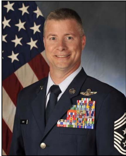
Current Command Chief