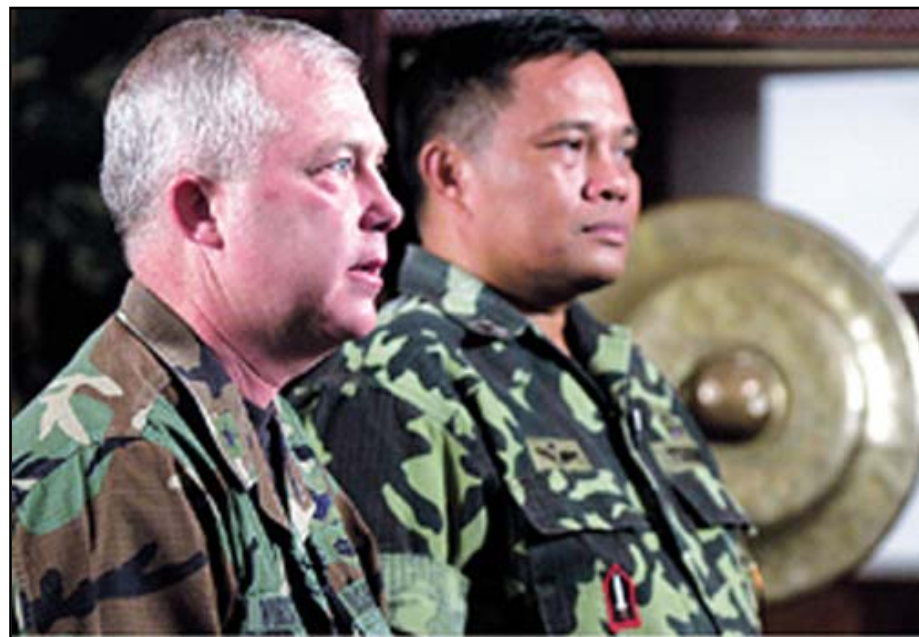
Brig Gen Donald C. Wurster and Lt Gen Roy Cimatu led the fight in Operation ENDURING FREEDOM - Philippines.

of the Philippines. In January 2002, members of AFSOC headed by Brig Gen Donald C. Wurster, commander of Special Operations Command Pacific, deployed as Joint Task Force 510 to support Operation ENDURING FREEDOM – Philippines (OEF-P). AFSOC members joined their counterparts from the Southern Command of the Armed Forces of the Philippines (AFP), commanded by Lt Gen Roy Cimatu. Air Force special operations forces advised and assisted the AFP to help combat terrorism in the country. Much of the operation took place on the island of Basilan in the southern region of the Philippines—a stronghold of the terrorist group Abu Sayyaf. The group had terrorized the citizens of the beautiful island and wreaked havoc on its economy. By the end of the operation, the two forces had built 81 kilometers of road, improved an airfield and port facility, and dug fresh water