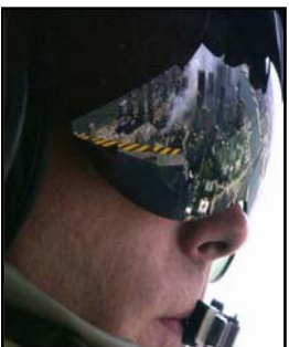
A 20th SOS crew-member in an MH-53M Pave Low over ground zero.

In addition to Afghanistan, Operation ENDURING FREEDOM involved a global effort against terrorism to include the Horn of Africa, as well as the Republic